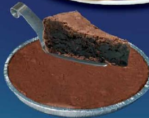
M Fudge Brownie Pie Pastel de Chocolate

Made with real, creamy whipped peanut butter. Nobody can eat just one!