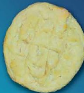
II Peanut Butter Mantequilla de Cacahuete

FOUR POUNDS! A 2 lb Tub of Chocolate Chunk and a 2 lb Tub of Sugar Shortbread