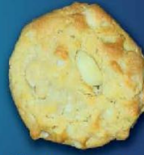
EE Macadamia Nut Nueces de Macadamia

Each Three Pound Tub makes up to 8 dozen cookies - depending on desired size.