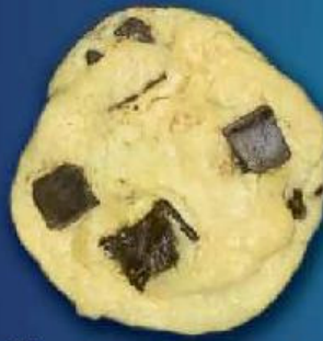
GG Chunky Chocolate Trozo de Chocolate

Soft and chewy with a dash of cinnamon in every bite.