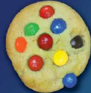
L Chunky Chocolate & Sugar Dough Galletas de Azucar y Trozos de Chocolate

Smooth dough packed with M&M chocolate candies. Popular with the candy lovers!