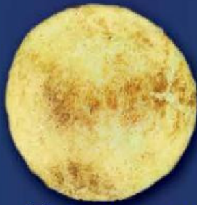
CC Snickerdoodle Snickerdoodle

Soft and chewy with a dash of cinnamon in every bite.