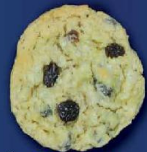
FF Oatmeal Raisin Pasas con Avena

Delicious white chocolate chunks and real Hawaiian Macadamia nuts.