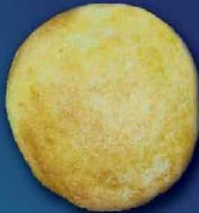
DD Sugar Shortbread Galletas de Azucar

Chewy oatmeal laced with moist plump raisins.